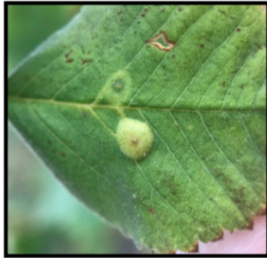
Gall Wasp Diplolepis rosaefolii