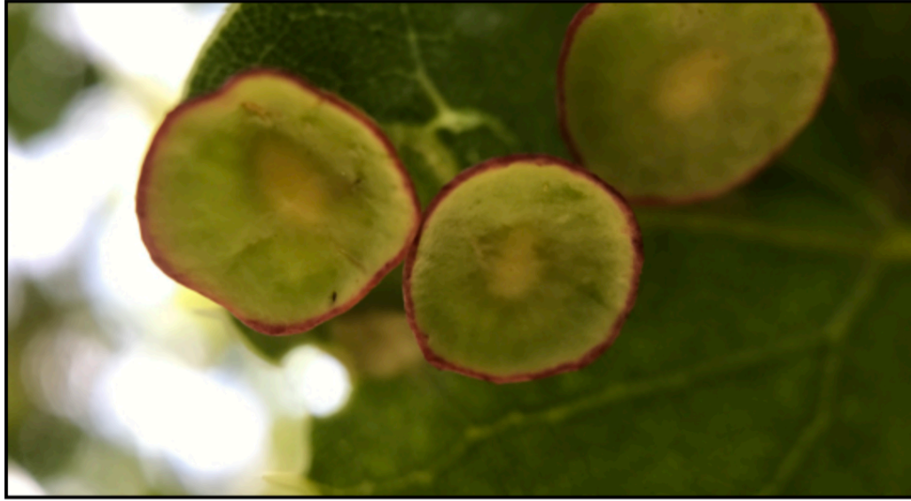
Live Oak Apple Gall Wasp ( Callirhytis quercuspomiformis )