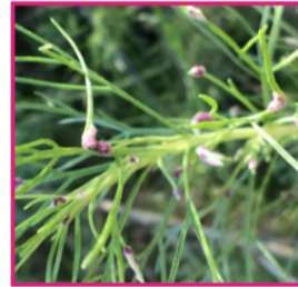
California Sagebrush Gall Mite Aceria paracalifornica