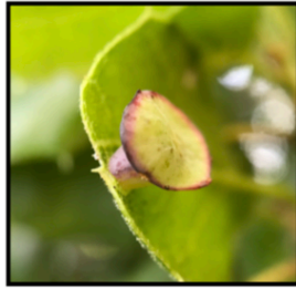
1. Black Oaks

Live Oak Apple Gall Wasp ( Callirhytis quercuspomiformis ) Spring Bisexual Gall (L); Summer Unisexual Gall (R)